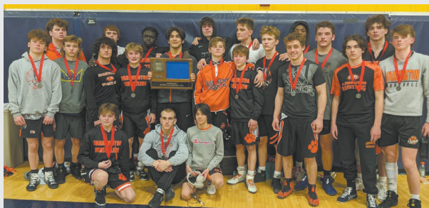
Farmington Tigers 2021-22 Wrestling Team

The coaching staff is very proud of the effort the wrestlers gave and the way they carried themselves all night long.