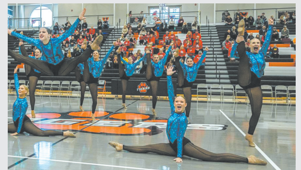
Farmington Tigers Dance Team perform at Farmington High School.

In a season filled with adversity, the FTDT continued to excel and rise with every occasion. Saturday night's performance at the Section 1 AAA meet was no exception. We are proud of the work our student-athletes and coaches put into every practice and competition, and thankful they are all Tigers!