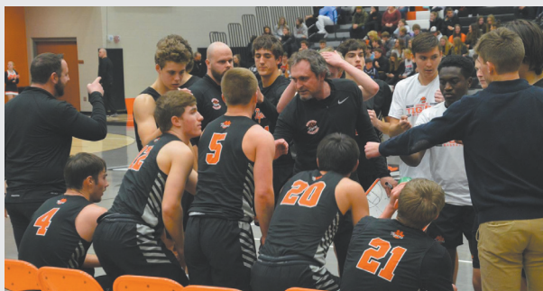
Farmington Tigers 2021-22 basketball team on the court.

Farmington entered the Section 1 AAAA playoffs as the #1 seed. They had a strong start to playoffs, defeating #8 Rochester John Marshall 80-53 in the opening round of the Section 1 AAAA Tournament. The Tigers advanced to host #4 Lakeville South on Saturday, March 12. Visit our website for the latest update ( www.farmington.k12.mn.us )