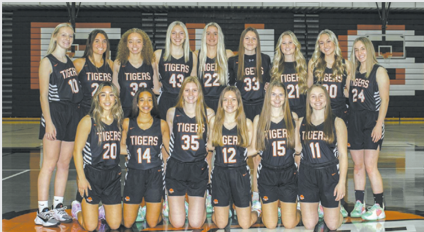
Farmington Tigers 2021-22 Girls' Basketball Team

Congratulations to our student-athletes for their exceptional commitment to both the classroom and the court.